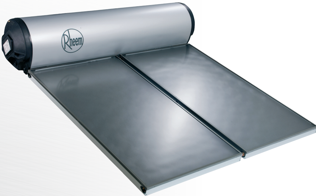
MODEL NO. 52C300/2NPT

CYLINDER COLLECTOR (supply only) WARRANTY 5